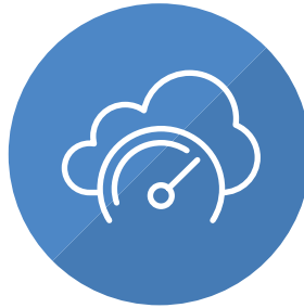
The inability to manage a cloud solution

That's why the health plan turned to NTT DATA Services. Our flexible, customizable healthcare digital consumer platform provided the client with: