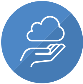
A lack of self-service tools

Let's face it: The lack of easy-to-use tools can stunt member and provider collaboration. And the tools available in the market tend to be one-size-fits-all solutions that may not meet the needs — or budgets — of health plans. This was particularly challenging for one regional health plan due to: