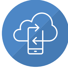
Provide self-service and transactions via a single channel