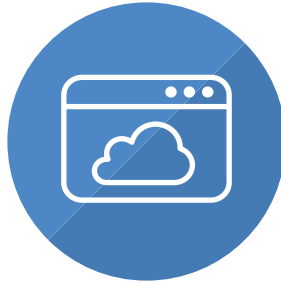
Avoid upgrades with a future-ready platform

Transform your health plan with solutions that prioritize your most pressing business needs.