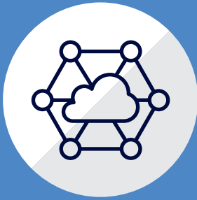
The ability to work on any device — desktop, mobile and tablet