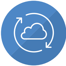
No available capital investment