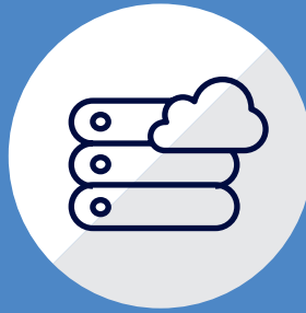
Managed cloud services hosted on an NTT DATA cloud

With the NTT DATA solution, the client was able to meet its business needs, as well as: