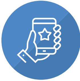
Enhance user experience